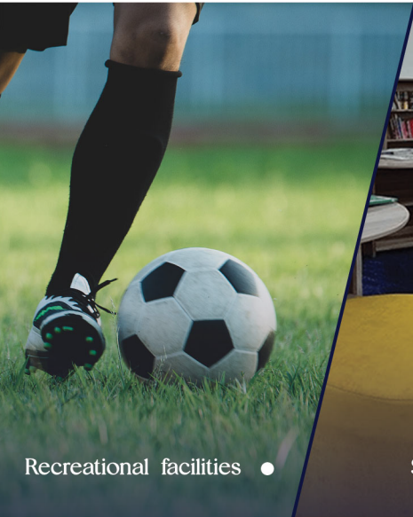
Recreational facilities ●