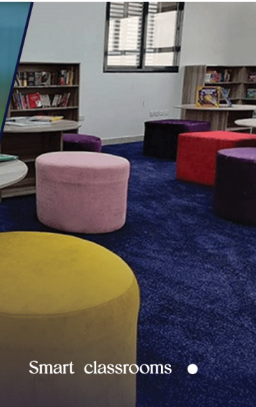
Smart classrooms ●