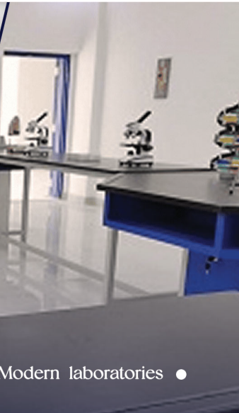
Modern laboratories ●