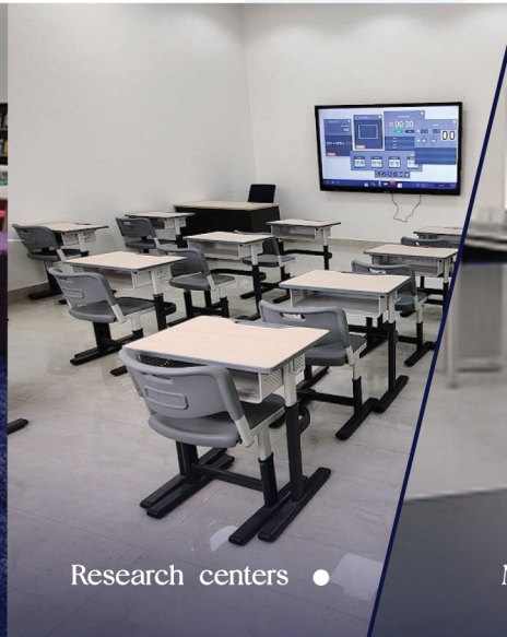
Research centers ●